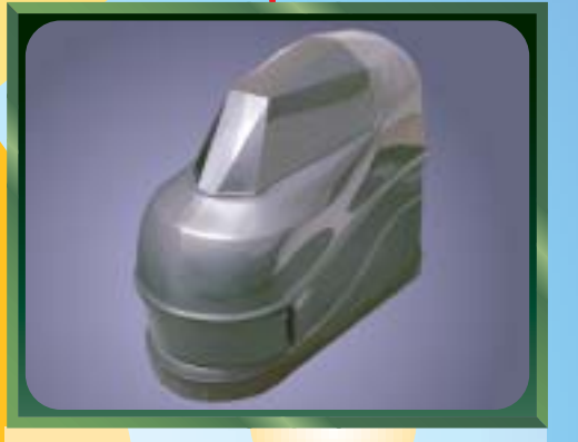
Tinted Window and Lift Top Creates sense of seclusion & provides gaming privacy.