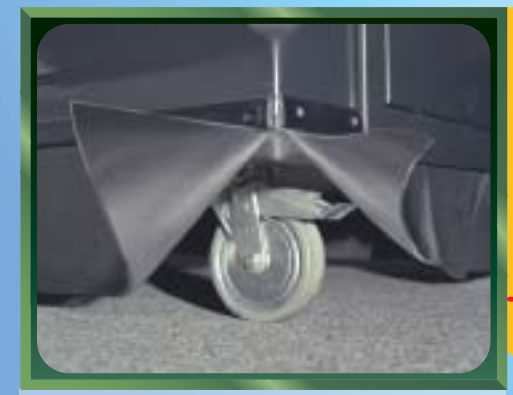
Heavy Castor Swivel Wheels For simple transport and portability. Locking wheels allow stationary positioning.