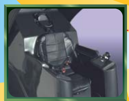
Ergonomically Designed Molded armrests and comfortable seat enables longer game play.